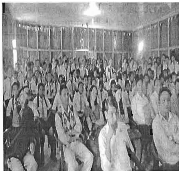
Programme at Sakyong Secondary School