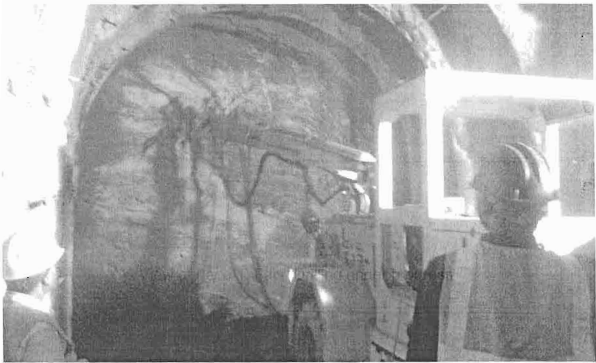
View of HRT Face-2: Shotcreting under progress.