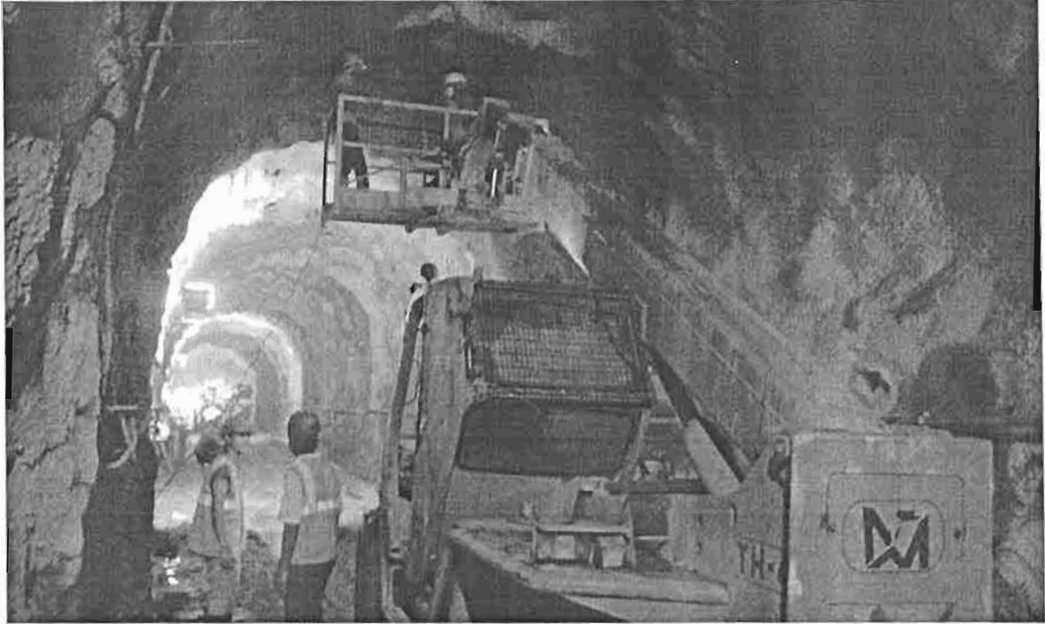
View of HRT Face-3: Arrangement for Ventilation Duct fixing under progress.