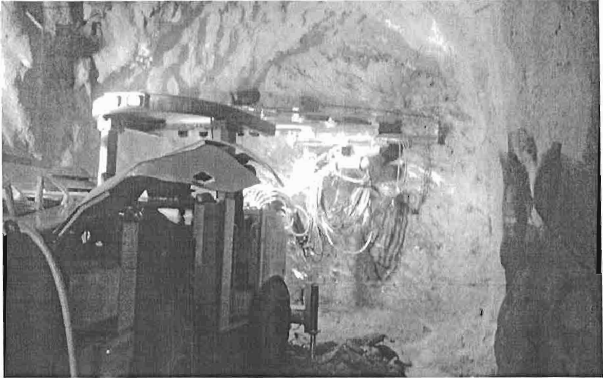
View of Face-1: Face Drilling under progress.